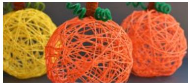
CHILDREN'S MINISTRY Fall Festival Crafts and Lunch

Wednesday, October 3, 9:00 am Children's Ministry Meeting Sunday, October 7, 12:00 pm Youth Room Safe Sanctuary Training Sunday, October 14, 4:30 pm Family Social for Youth Families at Vogel's Wednesday, October 17, 6:00 pm Best Christmas Pageant Ever first rehearsal Sunday, October 28, 11:45 am Fall Festival-Crafts and Lunch