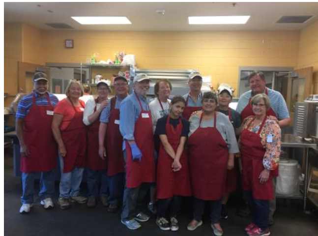
June 9 volunteers at Marian House Soup Kitchen