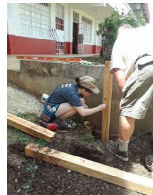
Belize Mission Trip-March, 2018